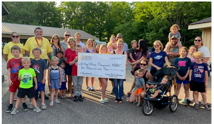
Pictured: Sierra Pacific Windows crew members and their families along with Our Village Playground Committee members

The donation was presented at the Summer Solstice Fundraiser party this past June. Fundraising efforts for the project are still underway.